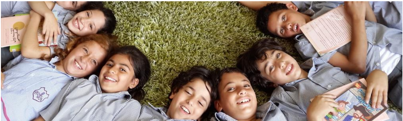
Students in Ramallah Friends School