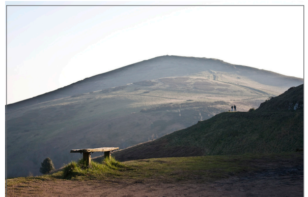
Malvern Hills