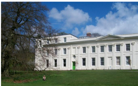
Woodbrooke